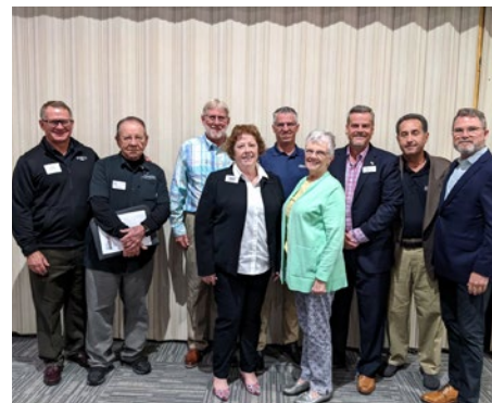
After two years of pandemic-related delays, members of the TCMA Board of Directors and staff gather at the association's annual meeting.

The company created a virtual showcase for sales and a virtual warehouse for instal-